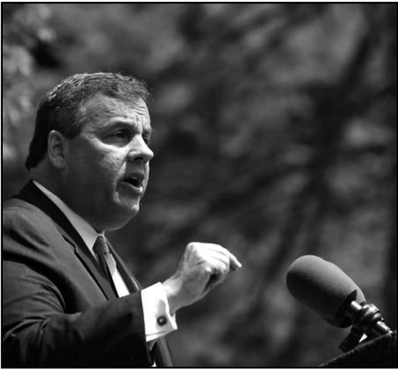
GAMBLING STATE New Jersey Gov. Chris Christie speaks during a news conference in Trenton, N.J., Tuesday. The Supreme Court agreed Tuesday to take up New Jersey's bid to allow sports betting at its casinos and racetracks.

Monster step might be an understatement. The legal sports books in